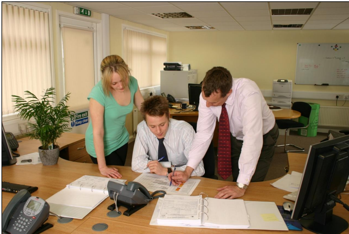
Amarinth staff work on a documentation package