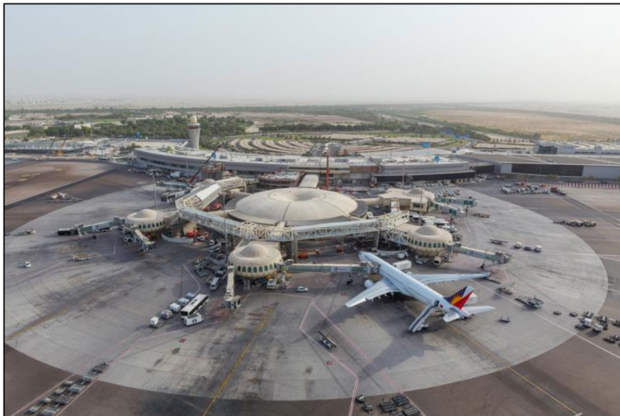
One of the new stands at Abu Dhabi International Airport that Amarinth API 610 pumps will be delivering jet fuel to