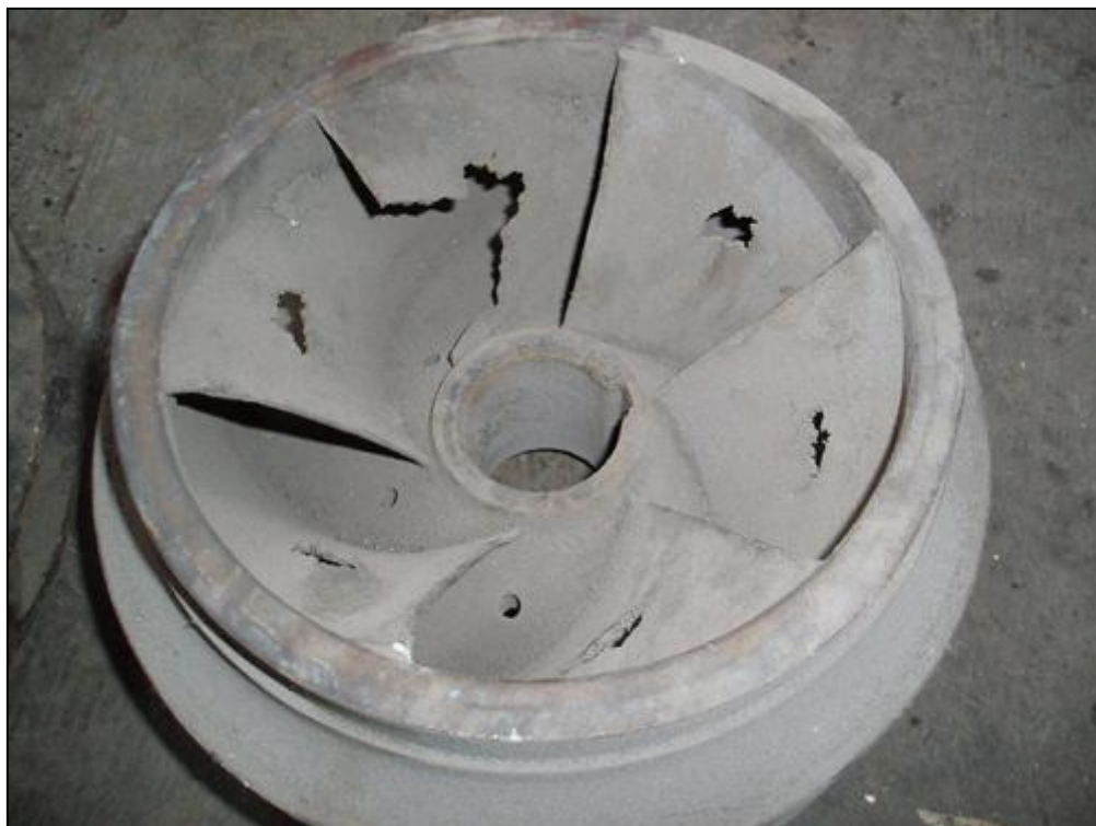
Damage to an impeller through cavitation due to poor selection for low NPSH duty