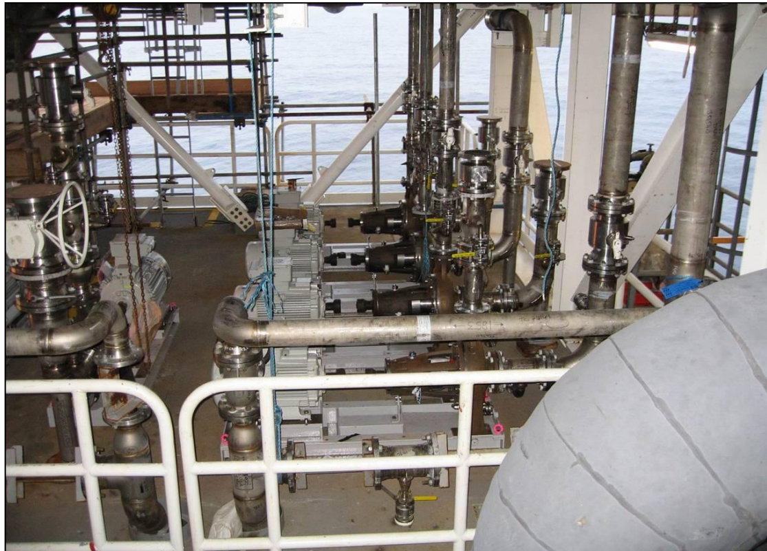
Amarinth pumps in-situ between decks of an FPSO