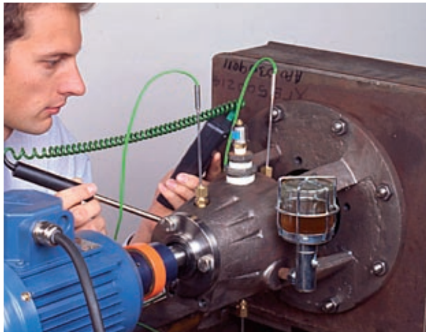
Fully tested to meet the exacting requirements of ATEX, all Amarith rotating assemblies have been tested, ensuring your plant is compliant for the future.